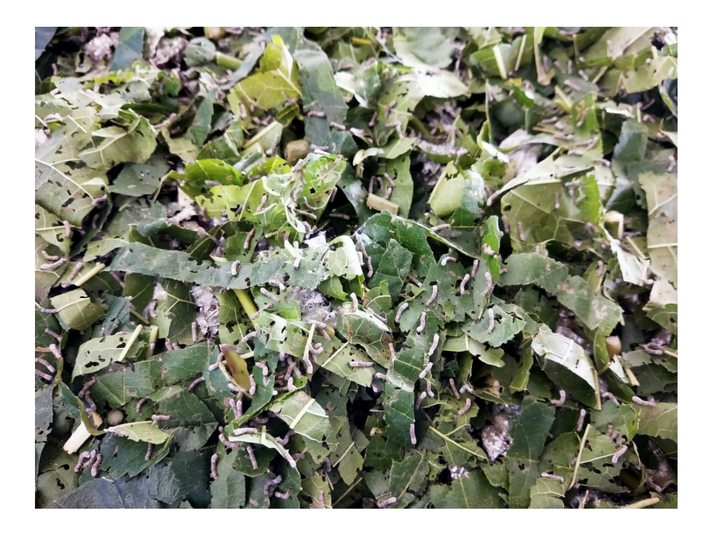
Fig. Larvae feeding on Mulberry leaves