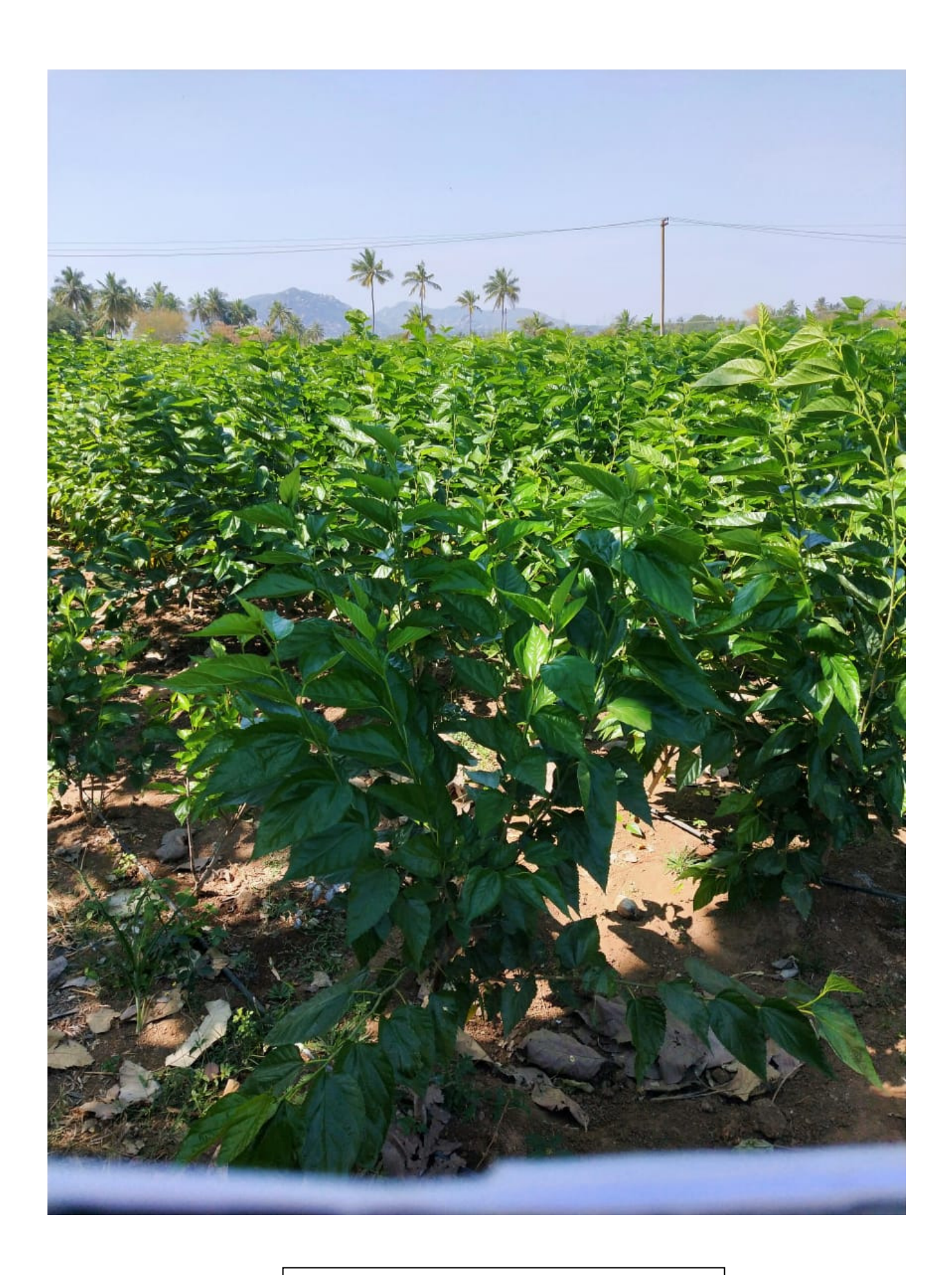
Fig. Mulberry plant