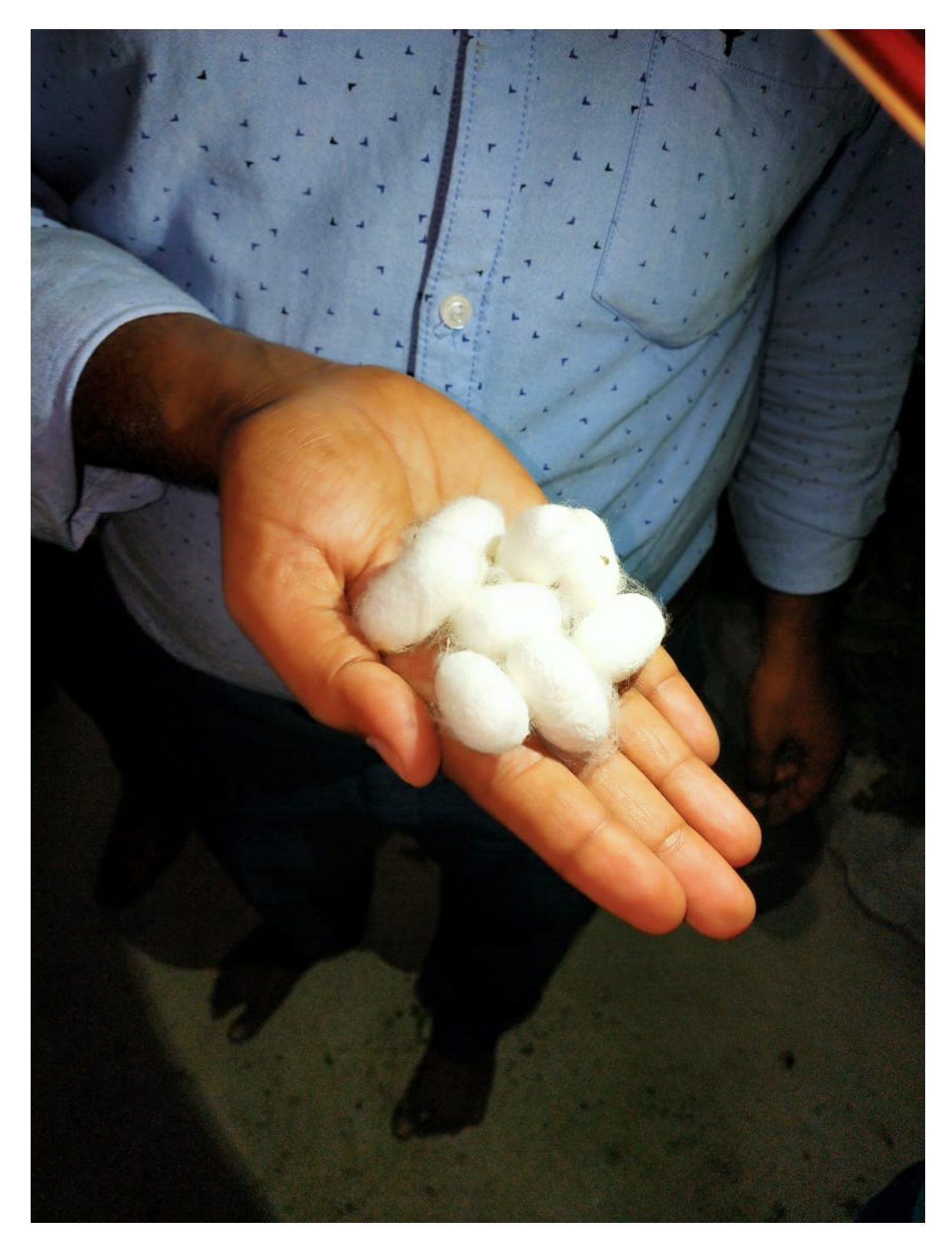
Fig.Cocoon (the cocoon is constructed from one continuous strand of silk, perhaps 1.5 km long (nearly a mile))