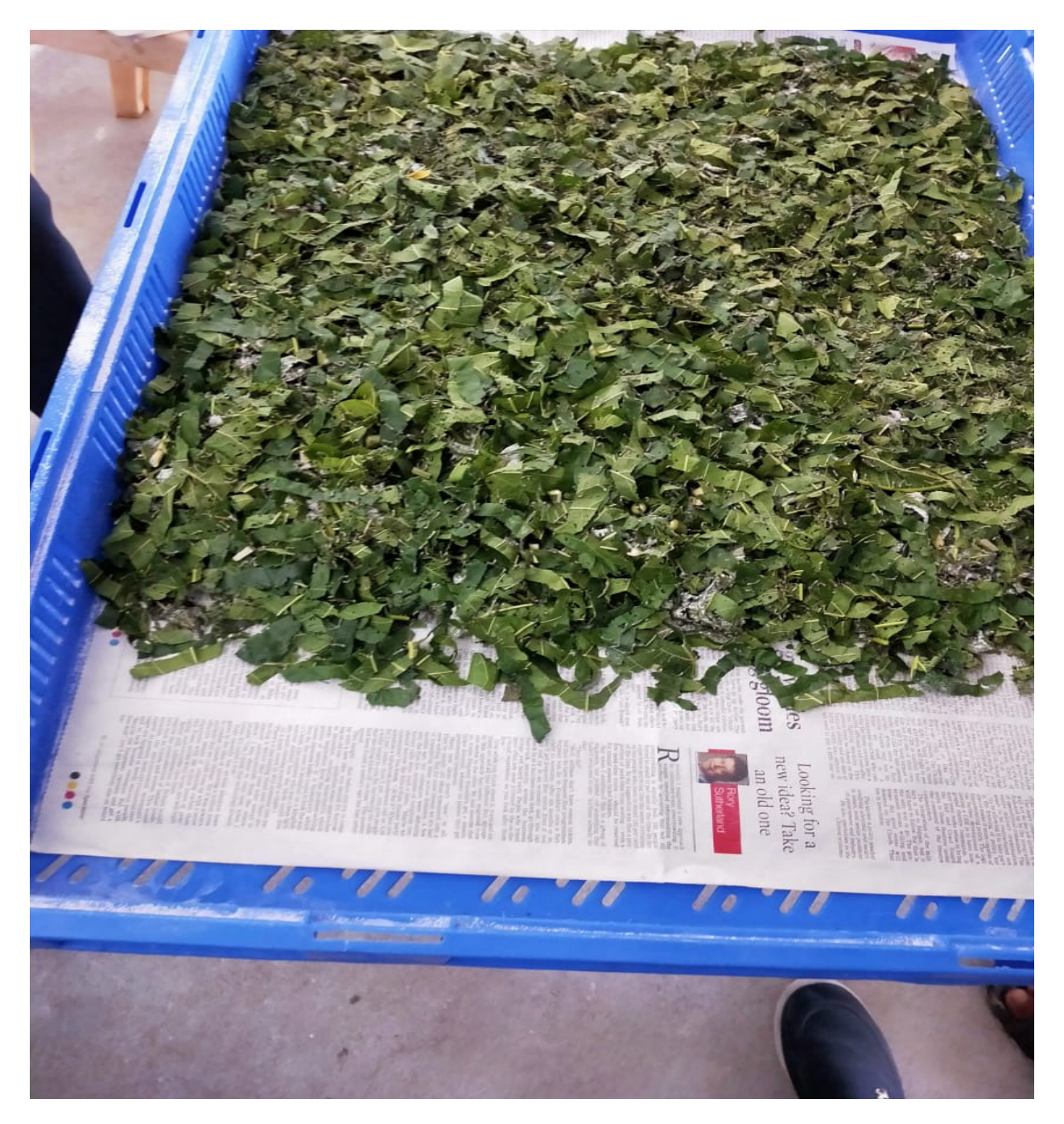
Fig. Larvae with mulbrry leaves