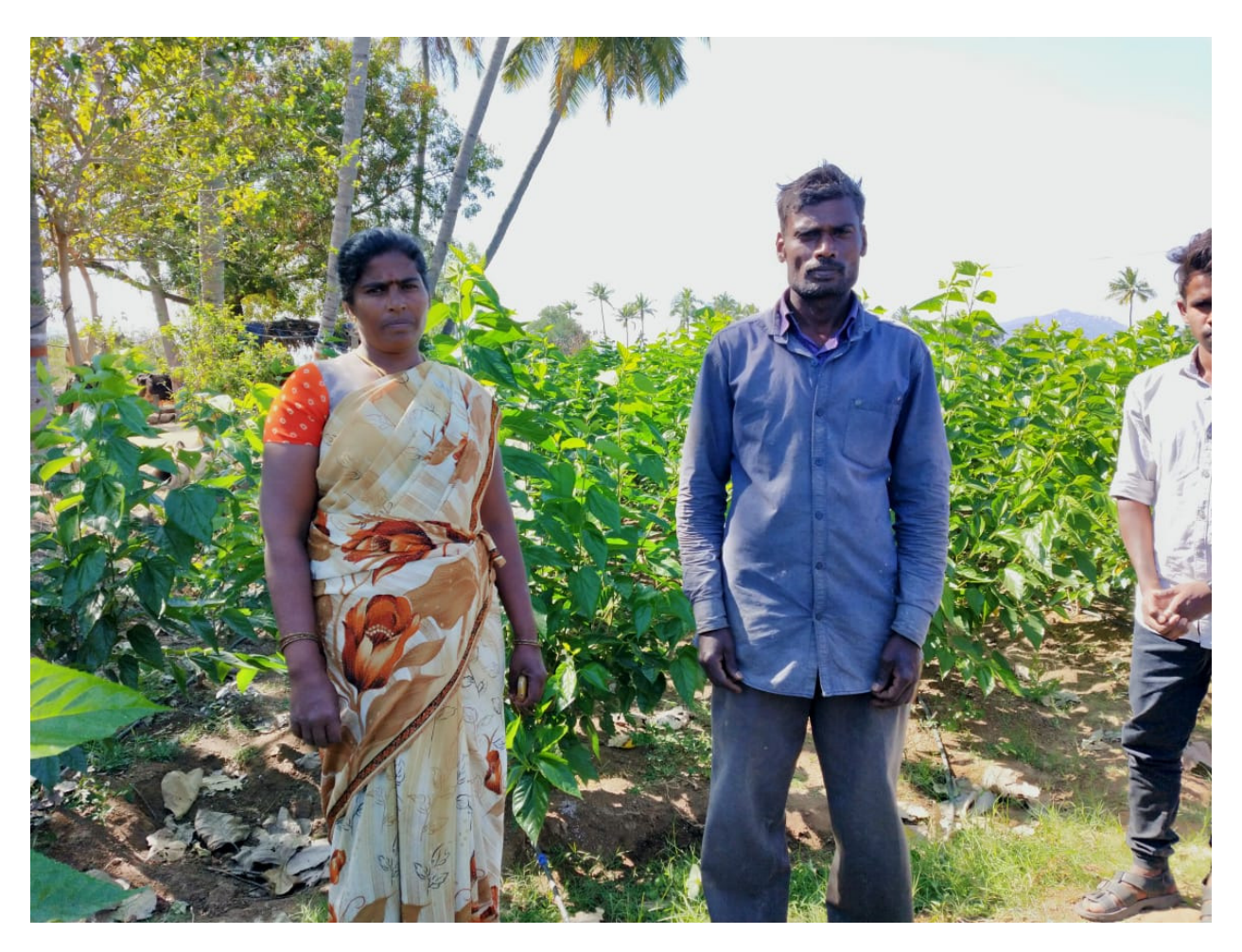
Farmers to explain and demonstration of the sericulture methods